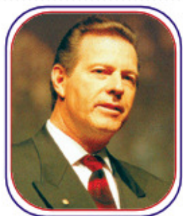
Hon. D. Gary Young, N.D., OSJ,

Deputy Minister for State of Utah, U.S.A. for the International States Parliament for Safety and Peace